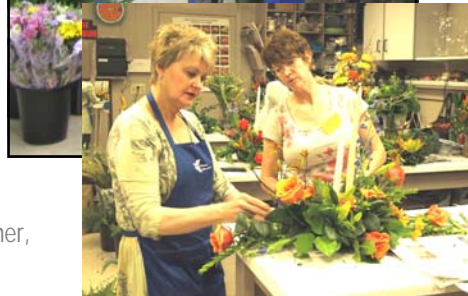
Photos: Bridal Bouquets class, International Design Trends, Floristry 3